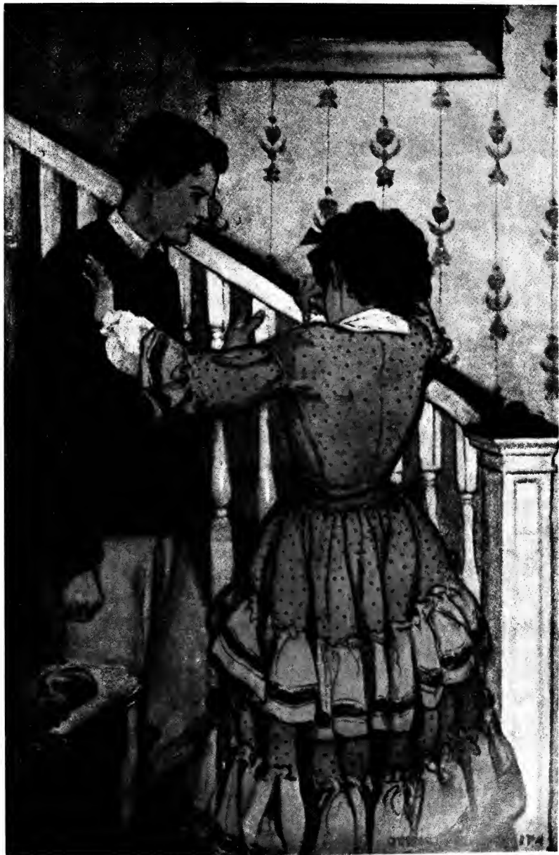
Holding on to the banisters, she put him gently away. Page 198.